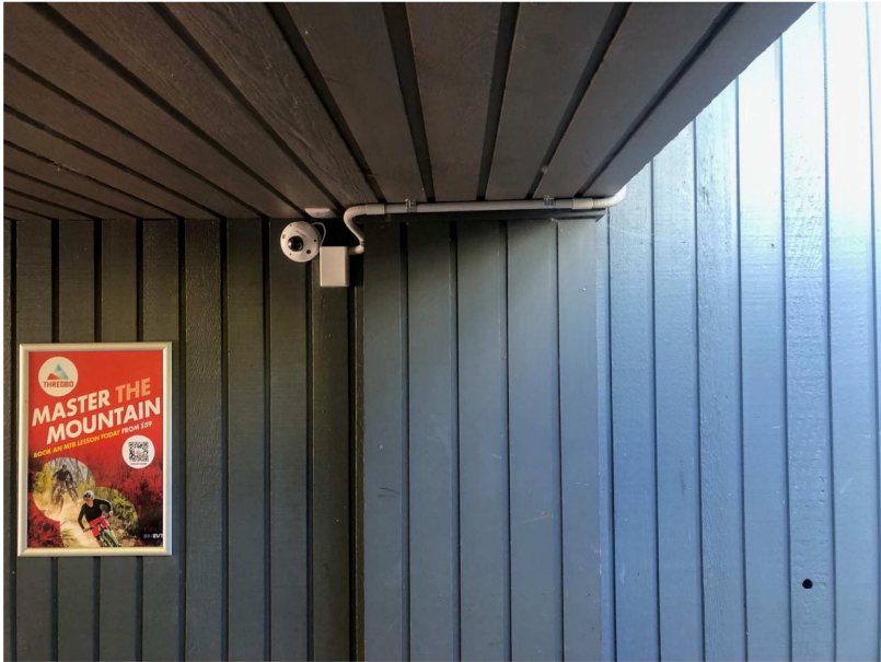
EAST/WEST VIEWS OF ALPINE HOTEL